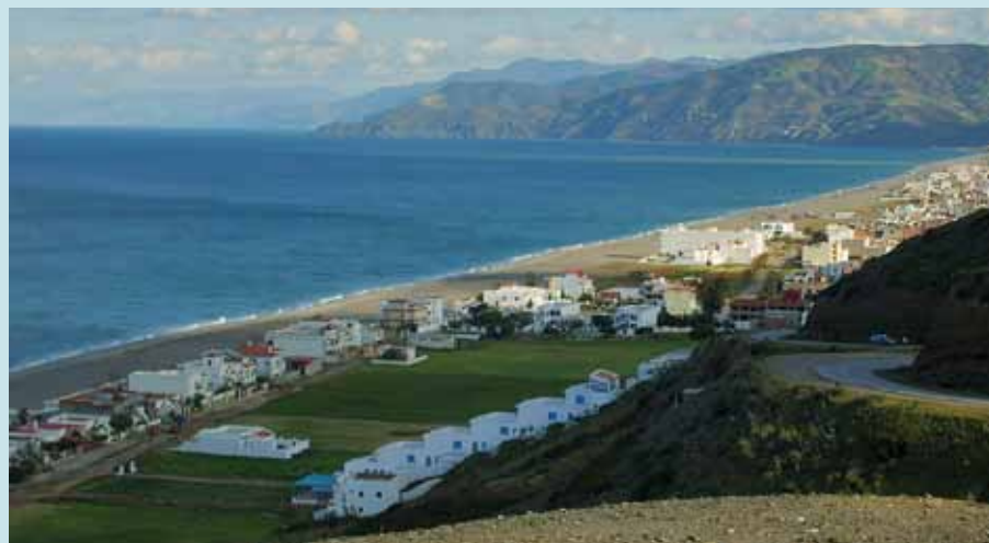
Oued Laou Beach