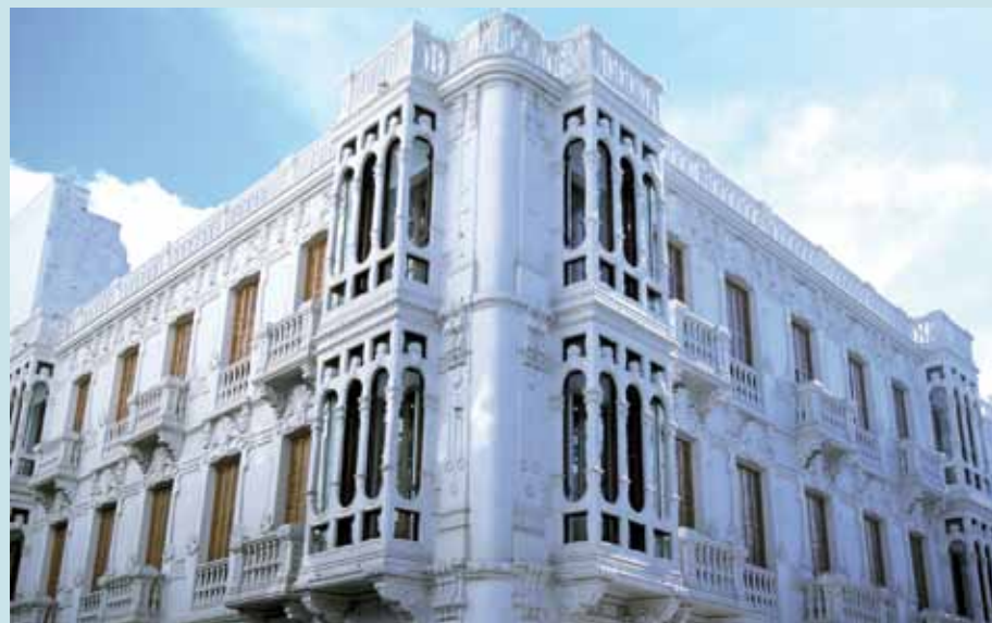
Spanish architecture of the twentieth century

in the 30s. Its large documentary resources have turned it into a reading and research place dedicated to the history of Morocco. This avenue also passes through the Square Moulay El Mehdi where is located the Church of Our Lady of Victory, built in 1919. Square Al Adl, where you will find the courthouse and the cinema Avenida, is a legendary place in the city. As for the Spanish theater built in the 30s, it has been restored. Near Bab Okla. stands the school of traditional arts and crafts «Dar Sana» with its neo-Arabic architecture. It stands as a showcase for the different artistic expressions which have flourished for