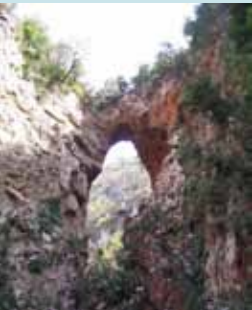
God's Bridge in Akchour