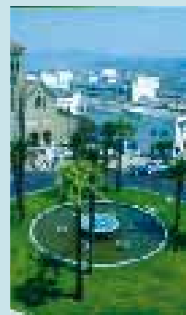
Square Moulay El Mehdi

of domestic architecture. Medina has benefited from a rehabilitation program financed by the Junta de Andalucía.