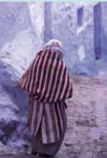
Woman of Chefchaouen

twenty mosques and sanctuaries, the city of Chefchaouen is imbued with an atmosphere of deep serenity. The new inhabitants built their houses blue and white with small doors leading onto Andalusian style patios. The city charm also comes from its alleys where you will not hesitate to get lost but where you will always find your way back. It is nice to walk in the cobbled streets, to dream while resting in one of the varied little squares shaded by fig trees and drinking mint tea. Nearby stands the Kasbah built in the seventeenth century by Moulay Ismail to defend the city from invaders. The Kasbah conceals pleasant and peaceful Andalusian gardens and a small museum where you can admire the pottery craft of the Rif, regional costumes and musical instruments, wooden chests for wedding days.