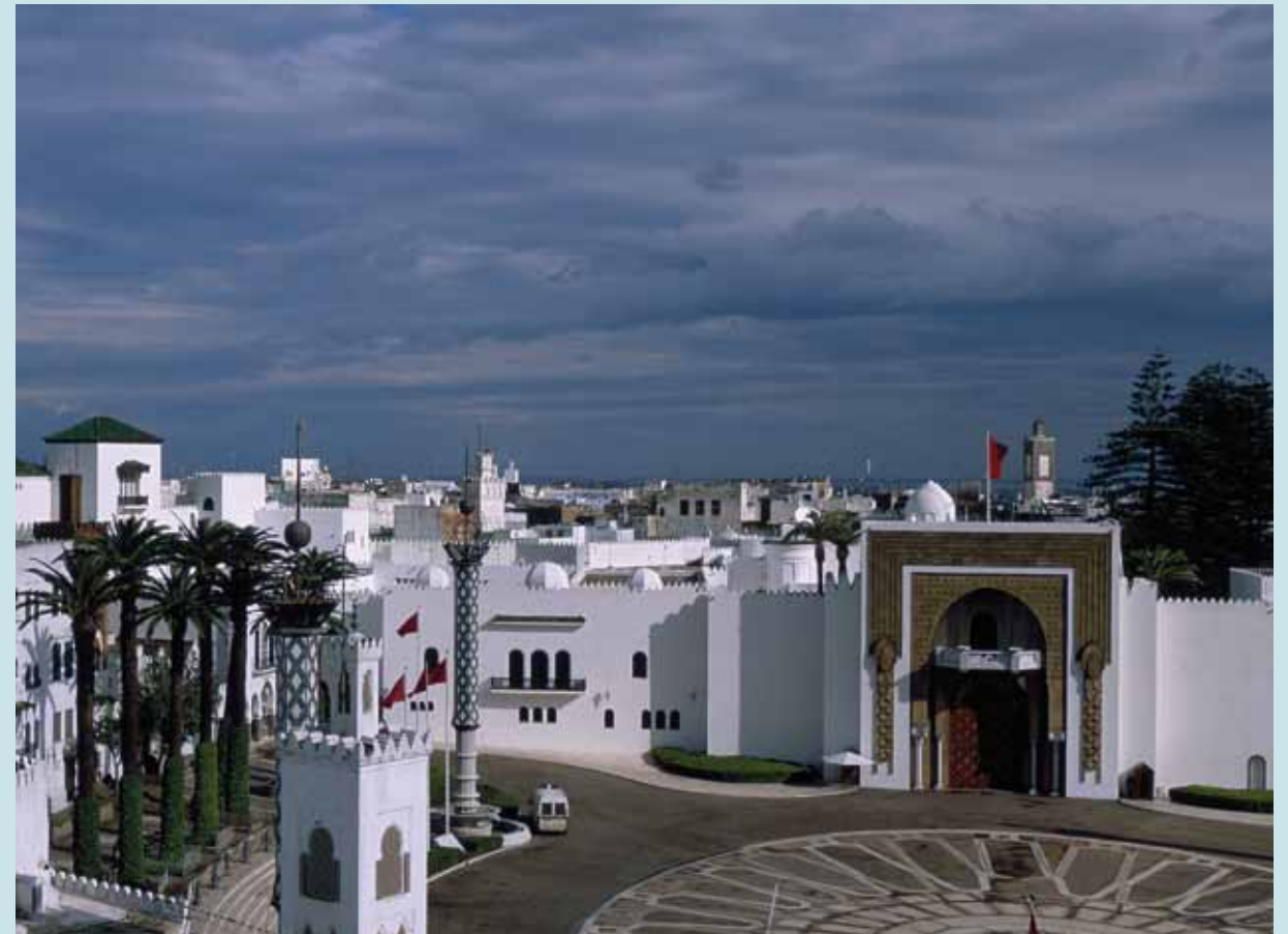
View of the Square of Feddane and the royal palace