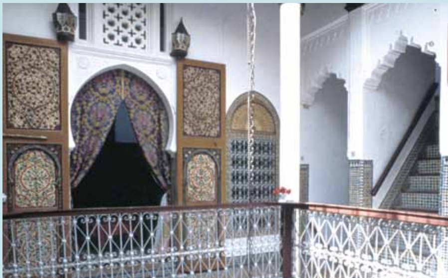
Inside a typical residence of the Medina of Tetouan

During the seventeenth and eighteenth centuries the city grows due to its status as a Mediterranean port where goods transited to and from the capital, Fez.