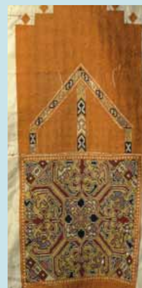
Embroidery from Tetouan

The latter is a masterpiece of Tetouan. When entering, you can enjoy a garden with a pool in the center and a wall fountain adorned with zellige a design similar to those found in the Andalusian palaces of Granada. Today, this museum present, with a permanent exhibition, traditional costumes and musical instruments, traditions, the habits and customs of the city of Tetouan and its region.