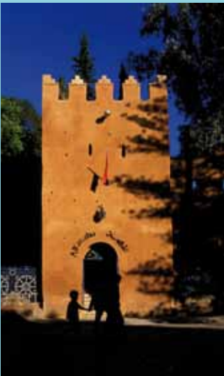
The Kasbah of Chefchaouen