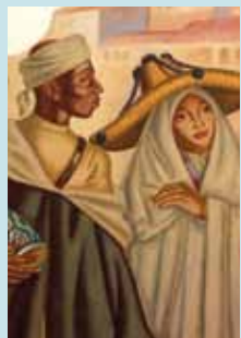
Wall Fresco of Carlos Gallegos

Visitors find it Andalusian, Ottoman, European. Tetouan is just all that. From this excitement is born a true art of living that still continues today through its craftsmen and artists. Land of the arts, from music to visual arts, the city is home to artistic movements, which influences go far beyond the region.