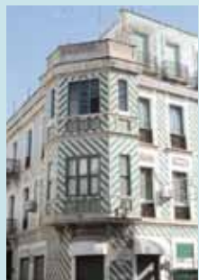
A house entrance in the medina

60 km from Tangier, Tetouan is characterized by the architecture of its houses built in the Andalusian style imported from Seville and Granada. With its green and white houses, its crenellated ramparts and shady squares, the Medina of Tetouan is a UNESCO World Heritage site since 1997.