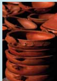
Oued Laou Pottery

Its name comes from al Khozama (lavender), a plant growing widely in the central Rif Mountains. Thanks to its geographical situation, Al Hoceima enjoys a pleasant