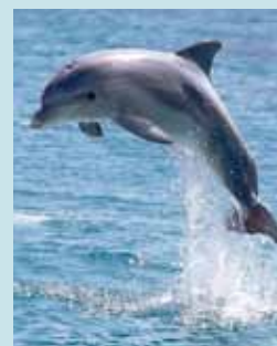
Dolphin in the Mediterranean

climate, where the mountain and the sea live together harmoniously. The area is home to a multitude of bays, coves and beaches with large stretches of calm, clear waters, perfect for various water sports and leisure beach resorts.