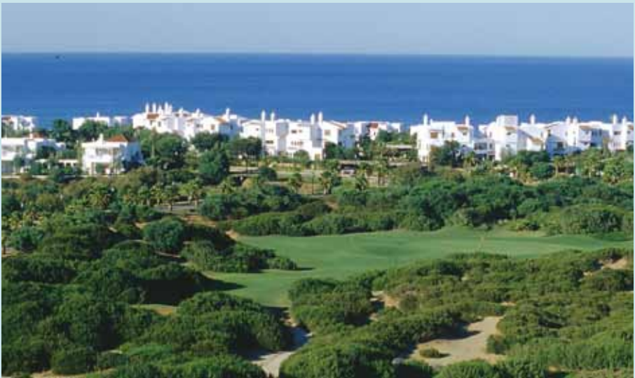
Cabo Negro Golf