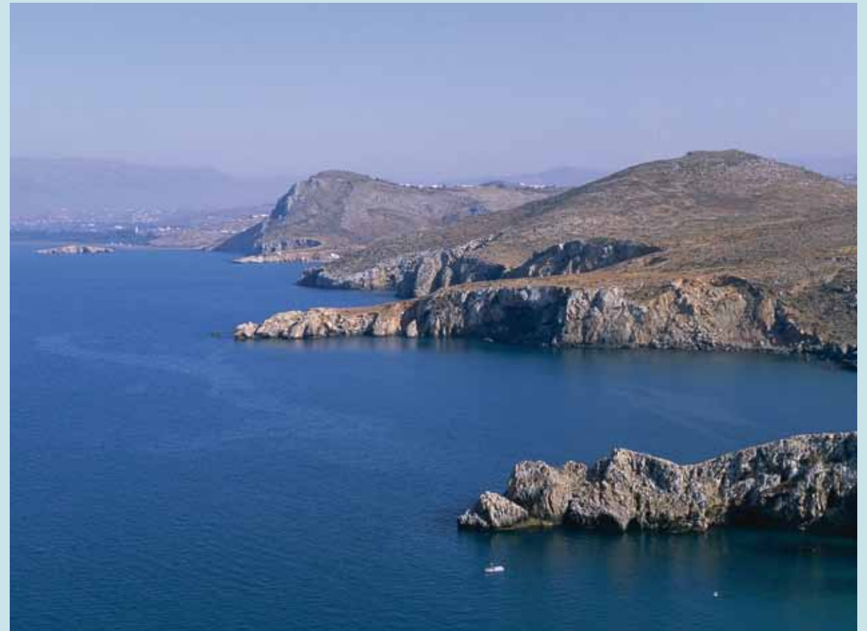
The crystal clear water of the Al Hoceima coast