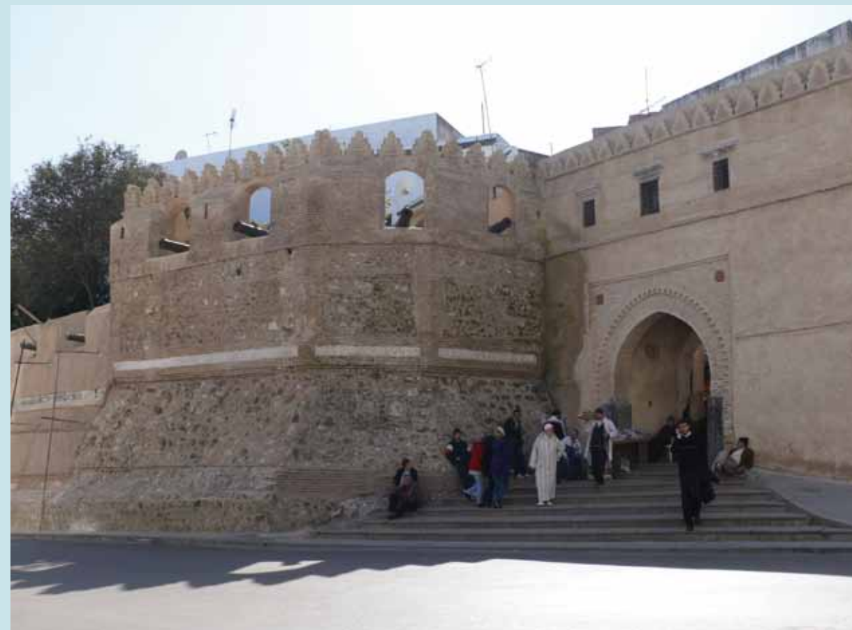
Rampart Wall of the Medina of Tetouan