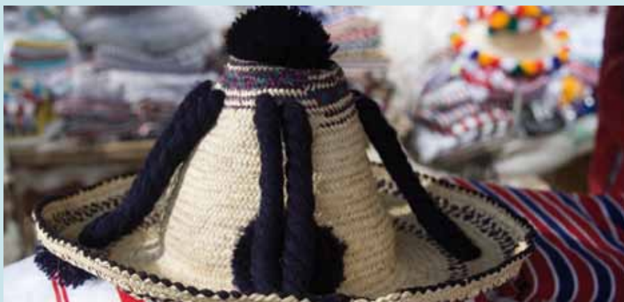
The textiles and clothes market «Guersa El Kébira»

As for culinary art, Tetouan is a combination of many influences (Rif, Andalusian, Jewish...), and