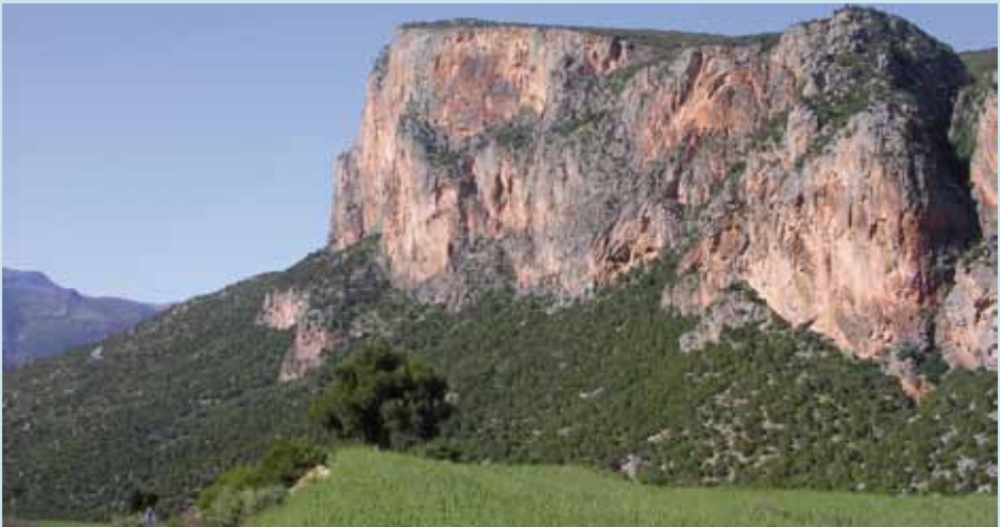
Talassemtane National Park

views and deep gorges combine closely. The park hosts over 1,380 plant species, including many endemic plants such as the Moroccan fir and the black pine tree, the last representatives of a unique ecosystem and today endangered species. The park is a unique refuge for over thirty-five species of mammals, including the famous magot monkey, living in the many caves scattered in the mountains, a wildlife rich with over a hundred listed species some as emblematic as the golden eagle or the buzzard.