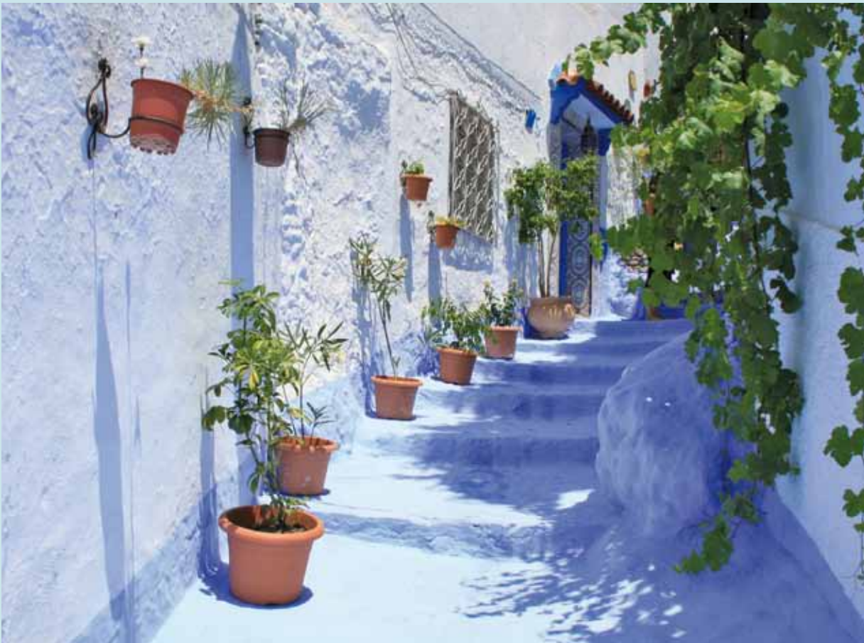
Alley in the medina of Chefchaouen