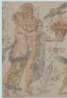
Roman Mosaic of Tamuda